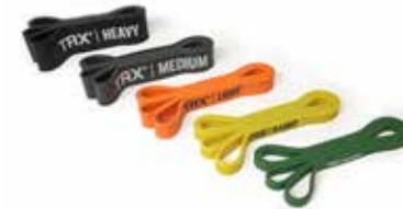
TRX STRENGTH BANDS XX-LIGHT .5 in. wide, X-LIGHT .8 in. wide, LIGHT 1.15 in. wide, MEDIUM 1.75 in. wide, HEAVY 2.5 in. wide