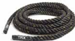
TRX CONDITIONING ROPE 1.5 in. x 30 ft. / 1.5 in. x 50 ft.