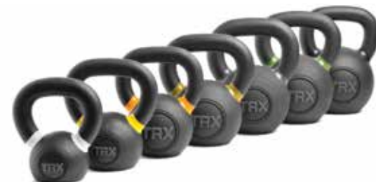
TRX KETTLEBELLS 4, 6, 8, 12, 16, 20, 24, 28, 32, 36 and 40 kgs.