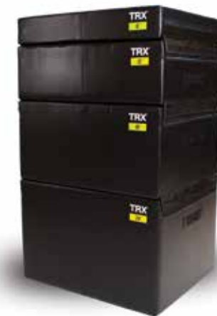
TRX PLYO BOXES 6, 12, 18 and 24 in.