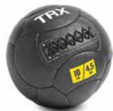
TRX MEDICINE BALLS 10 INCH : 4, 6, 8, 10 and 12 lbs. TRX WALL BALLS 14 INCH : 4, 6, 8, 10, 12, 14, 16, 18 and 20 lbs.