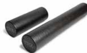
TRX FOAM ROLLERS 18 in. / 36 in.