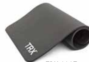
TRX MAT 2 ft. x 4 ft. x .5 in.