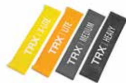
TRX MINI BANDS X-LIGHT / LIGHT / MEDIUM / HEAVY