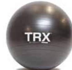
TRX STABILITY BALLS 55 in. / 65 in.