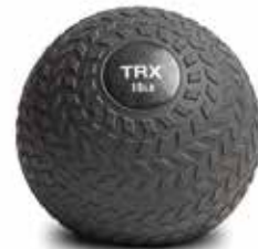
TRX SLAM BALLS 4, 6, 8, 10, 15, 20, 25, 30, 40 and 50 lbs.